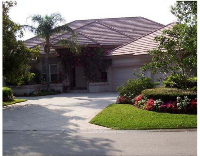
North River Drive East